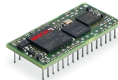
SC2x Flexible, simple and powerful