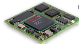
SC2x3 Maximum performance for demanding automation tasks