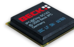
SC1x3 Maximum functionality in a minimum of space