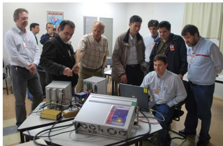
Hand-on sessions in Ludvika (Sweden), Frankfurt (Germany) and Itaipu (Brazil/Paraguay)