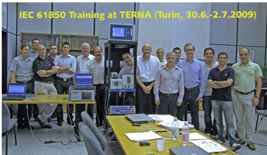
Participants of previous trainings in Ludvika (Sweden), Frankfurt (Germany), Turin (Italy)